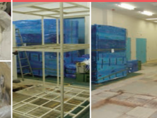
After disassembly Post-cleanup