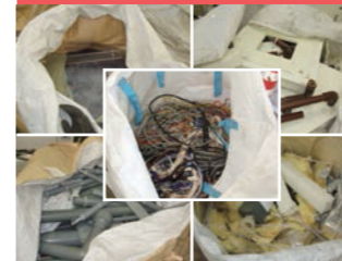
4 After disassembly; project complete