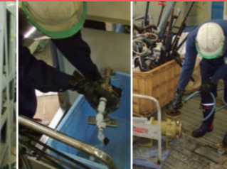
Extracting chemicals Cleaning